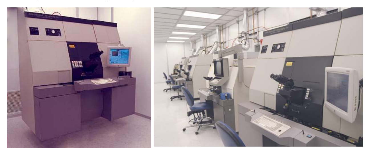
"We focus on high reliability, throughput enhancements, and reduced cost of ownership for our customers."

Beta Squared Lithography, Inc., the leader in Micralign<sup>TM</sup> Sales, Service, High Reliability Parts and Equipment Upgrades has a large inventory of Micralign<sup>TM</sup> Mask Aligners available for sale with or without OS2000. Let BSL configure a Micralign<sup>TM</sup> that meets your specifications.